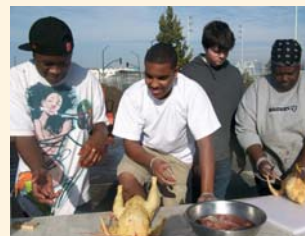
GYP team members work on removing the guts from one of our chickens.