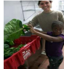
Children and teens taking part in the first Kids' Cooking Class in the APC Kitchen

We are also happy to announce the upcoming cooking classes that will be held in January. We will have classes on Thursday nights for kids and will be trying to use as many vegetables and fruits from our farm and their garden plots as we can. Each class we will make a different recipe and talk about nutrition of those recipes. We want the kids in our neighborhood to learn early on about eating healthy and hope that they will pass the information on to their parents. We will also be starting our Monday FEASTS – Families Eating and Sharing Traditions. These will happen on the last Monday of every month and will give families a chance to come, learn and share about different cooking traditions, and discuss health issues that may be on their minds. The first Monday FEAST will focus on American Multiculturalism and we are hoping to have lots of the APC community come out to share in one of our first events for the kitchen.