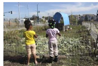
APC Community enjoying sunshine, food and our chickens at the 2nd Annual Harvest Festival