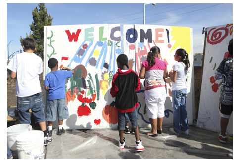
Kids from the APC Community come together to help paint a mural on the doors of the GYP Farm

Along with the amazing weather, our festival brought many people out and we all had fun. All the games, food, and entertainment really set it off and made that day something special.